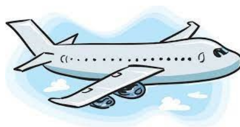
Information Portal for both trips