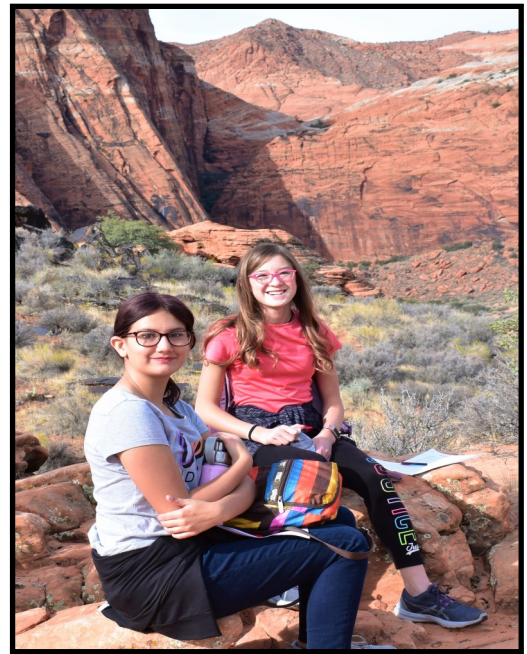
The freshmen girls soccer team (top left) just ended their season as did the cross country team (bottom left). The creative writing class went on a field trip to Snow Canyon State Park last week (above).