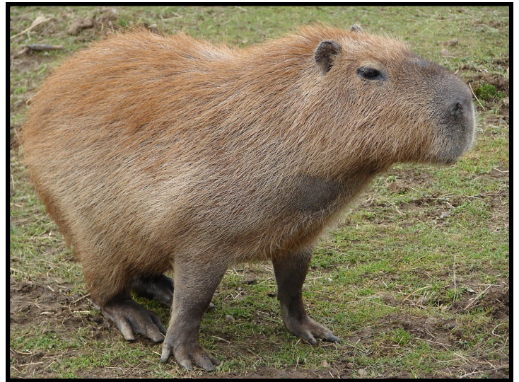
Image above shows Capybara